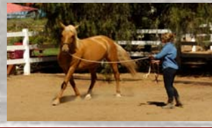
Featured in Perfect Horse Magazine

Come join in the fun at this interactive and educational clinic to benefit therapeutic riding. Work one on one and learn the tools that you are missing to create the partnership you have dreamed of.